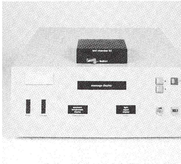
FIG. A1.3 Apparatus Exterior