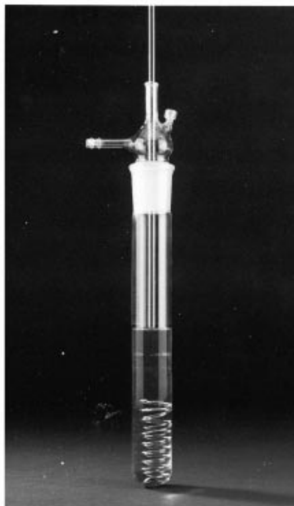
FIG. 3 Assembled Test Cell Ready to Insert Into Heating Block