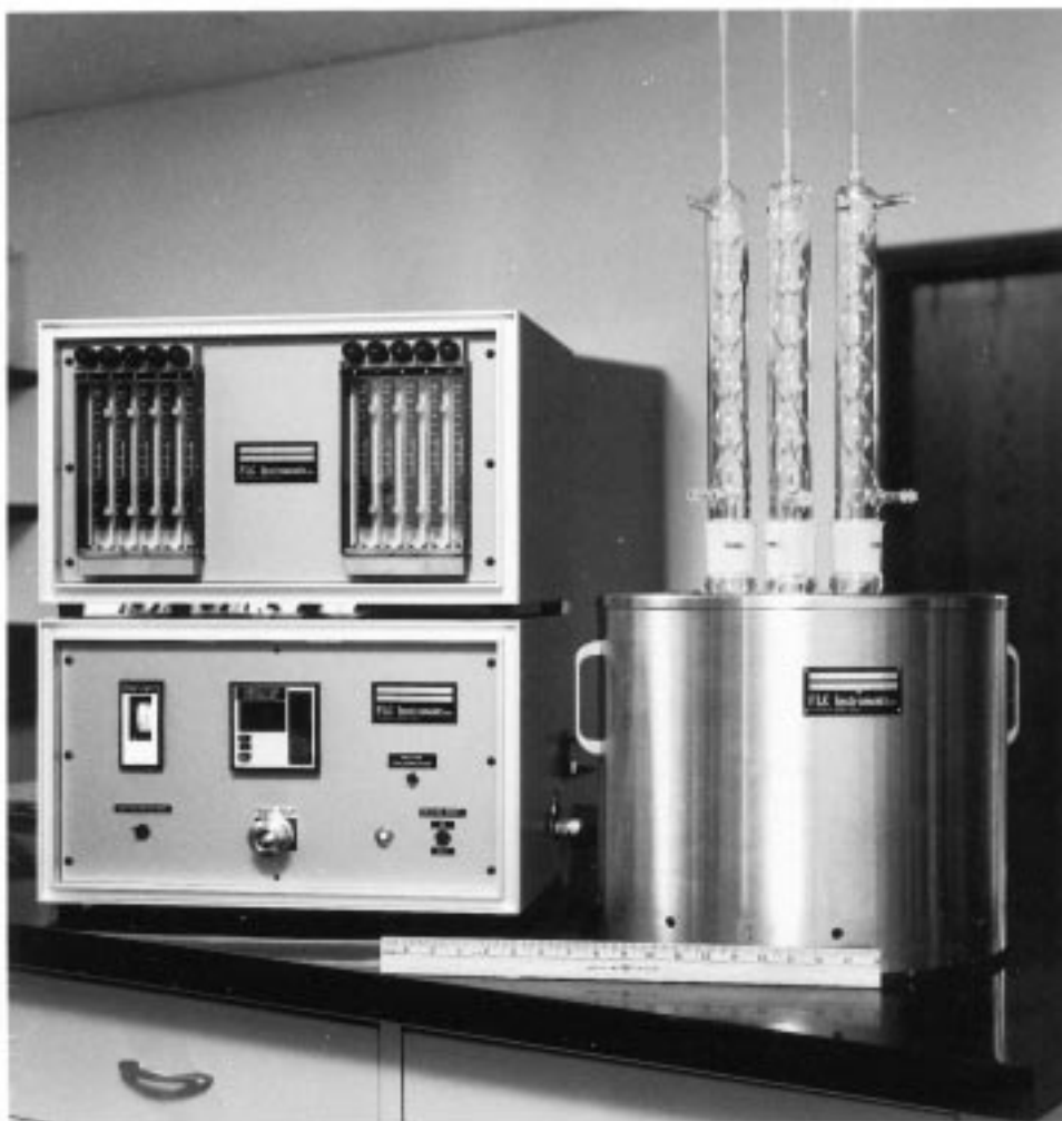
FIG. 1 Apparatus, Showing Gas Flow Control System, Temperature Control System, and Heating Block

6.3.2 Flowmeters shall have a scale length sufficiently long to permit accurate reading and control to within 5 % of full scale.