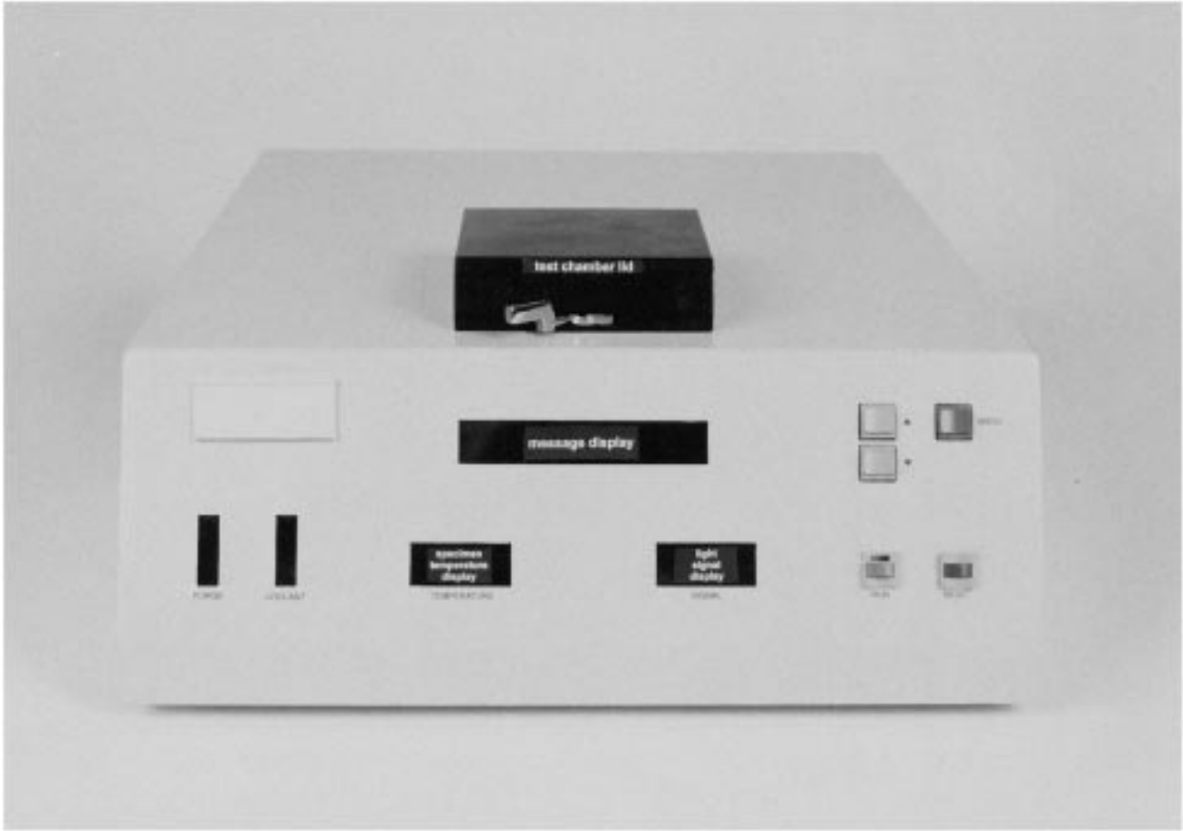
FIG. A1.3 Apparatus Exterior

A1.1.6 Apparatus Exterior Interface , the exact layout of controls and display may vary; however, a typical apparatus is shown in Fig. A1.3.