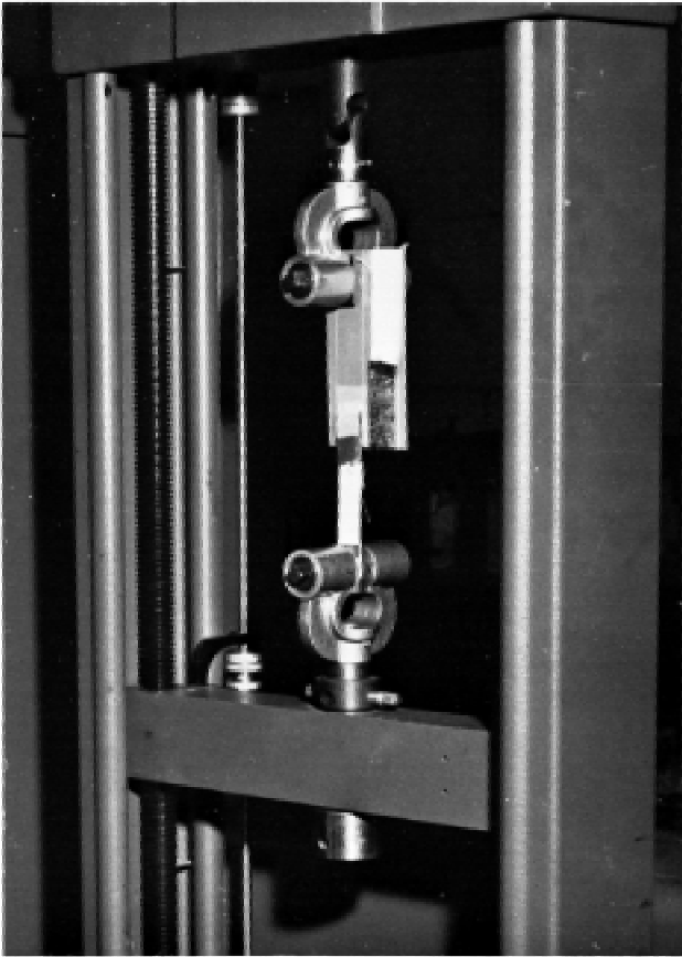
FIG. 2 Extension Machine Used in the Adhesion-in-Peel Test

mean value and is often \pm 100\% . The reason for this inter-laboratory variation has not yet been determined.