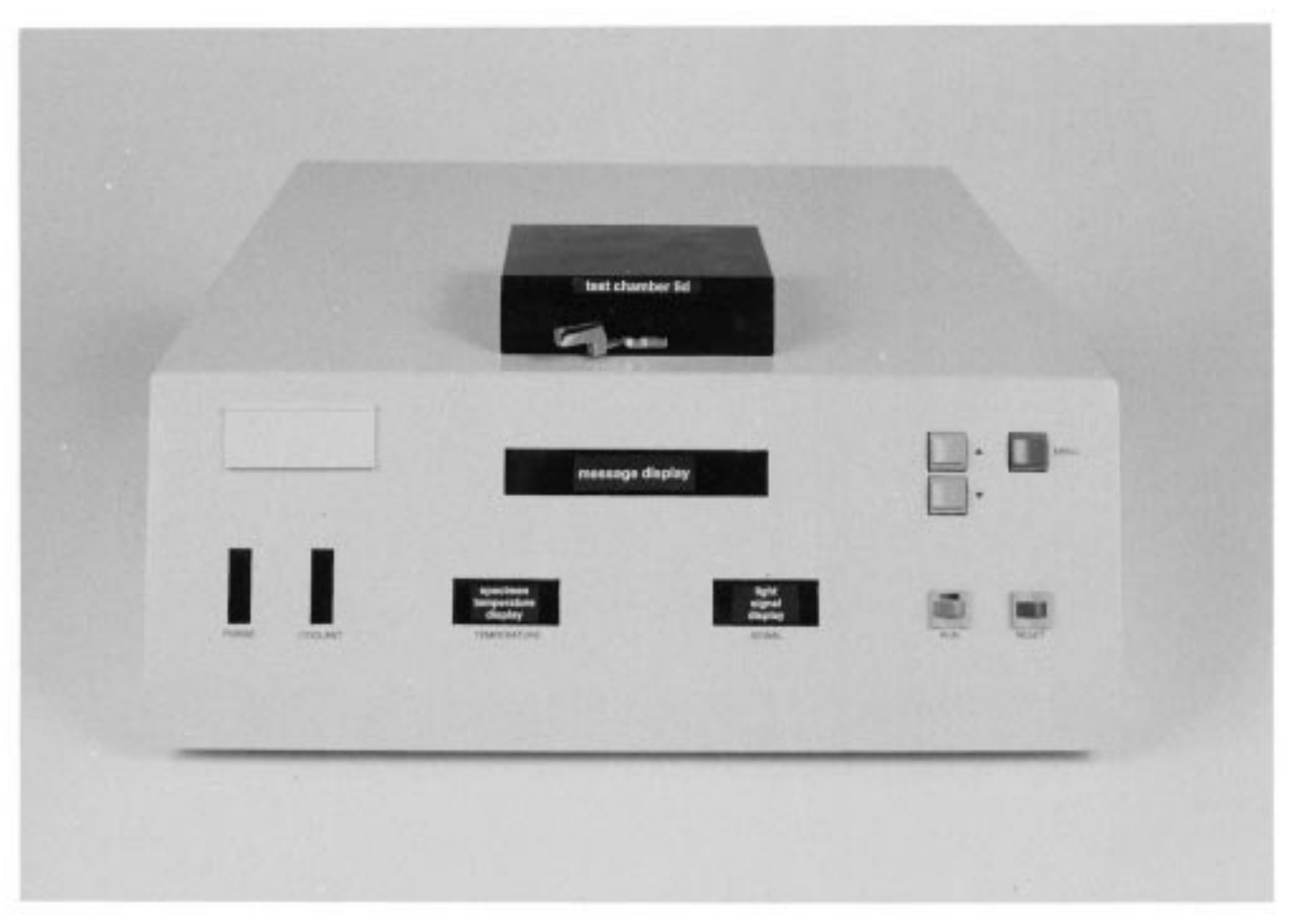
FIG. A1.3 Apparatus Exterior

ASTM International takes no position respecting the validity of any patent rights asserted in connection with any item mentioned in this standard. Users of this standard are expressly advised that determination of the validity of any such patent rights, and the risk of infringement of such rights, are entirely their own responsibility.